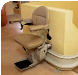
Top or bottom park position extends rail away from the staircase.