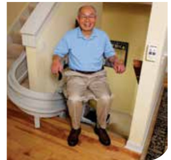
Mid-park and charge station for staircases with middle landings.