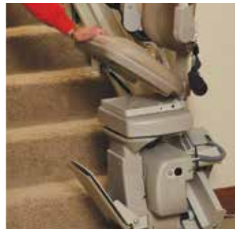
Power folding footrest automatically flips up/down when seat is raised/lowered.